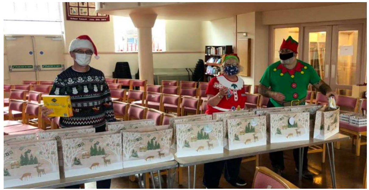
Santa's little elfers came to the rescue by packing Christmas gift bags which were well received

With the suspension of activities within the church and social distancing throughout 2020, all the team's usual mission and outreach work couldn't take place. However, in an endeavour to keep in touch with our Lunch Club, Tea & Chat members and people identified as living alone or isolated in our community, it was decided to put together Christmas gift bags to show that they hadn't been forgotten by the church and lift their spirits at Christmas. A total of 75 were delivered and were very much appreciated. Many thanks to all those who contributed and made it happen.